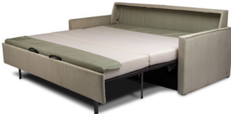
Natasha Queen Sleeper 69X41X38